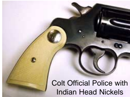
Colt Official Police with Indian Head Nickels