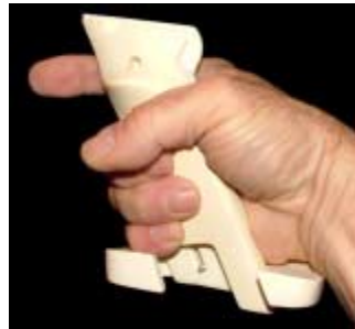
Ruger Mark II/III Target Grips with adjustable rest