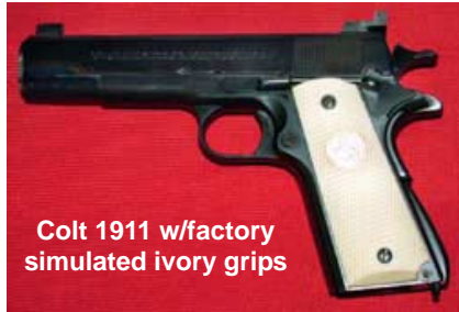
Colt 1911 w/factory simulated ivory grips