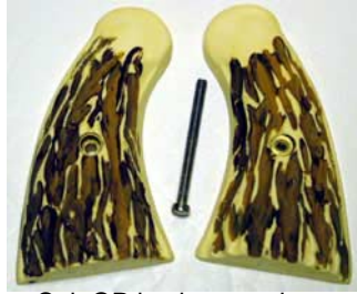
Colt OP in sim. stag horn