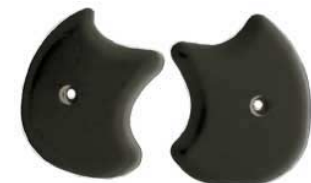
Available for discontinued and modern guns.

Tombstone Gun Grips can be ordered in custom colors or with special medallions, simulated gutta percha or pearl, and metallic looks (bronze, pewter, silver, gold, copper).