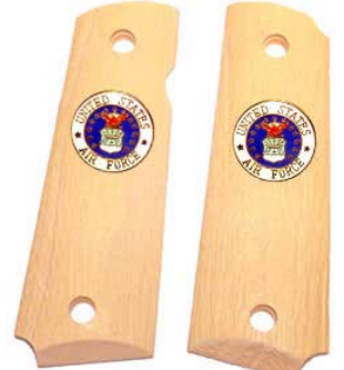
US Air Force medallions