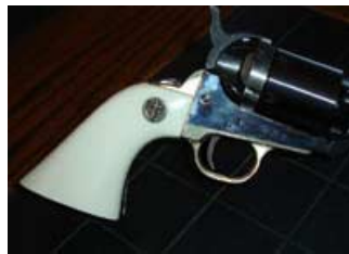
Single action in sim. ivory with silver/gold cross