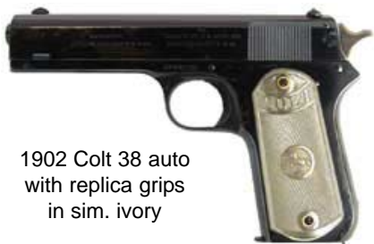
1902 Colt 38 auto with replica grips in sim. ivory