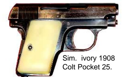
Sim. ivory 1908 Colt Pocket 25.