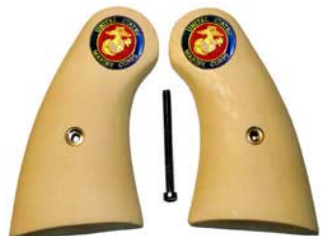
Colt Python or Official Police with US Marines medallions