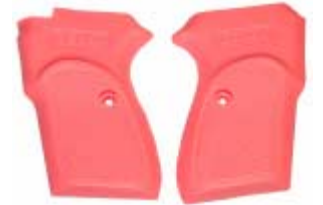
Bersa 380 Hot Pink

Tombstone Gun Grips can be ordered in custom colors or with special medallions, simulated gutta percha or pearl, and metallic looks (bronze, pewter, silver, gold, copper).